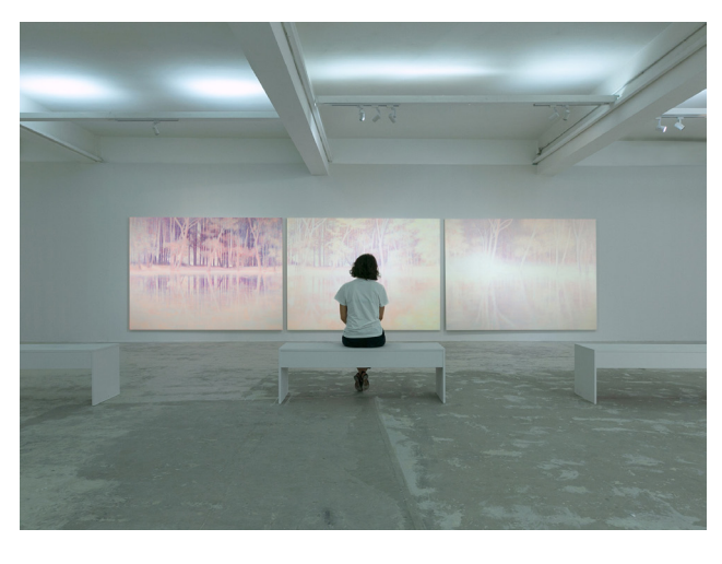
Exhibition View : Triptych: Purple Glade, Pink Gleam and White Clearing Acrylic and oil on canvas, 215 x 290 cm

Daniele Genadry's Quantum landscapes Morad Montazami, July 2020